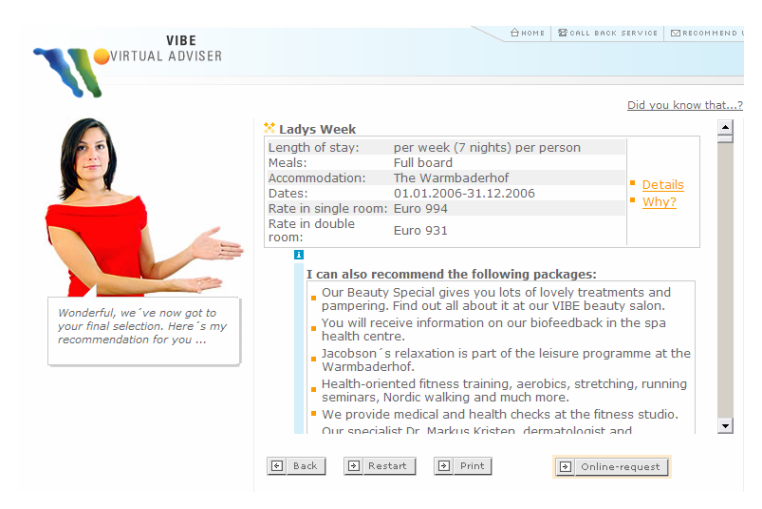
Fig. 2: VIBE's personalized recommendation